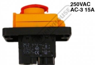
2BC0226 Switch 250V Side View