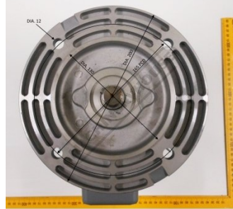
5BM0116 MOTOR 415V 7A 2