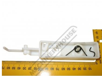
8TB0800 REAR DRAW CATCH.2