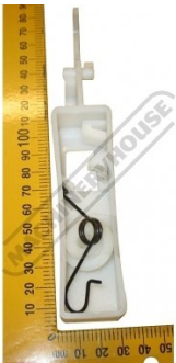
8TB0800 REAR DRAW CATCH