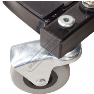
4 x Swivel Wheels