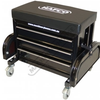
Side Trays Shown Folded Up