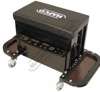
Rear Tool Storage Support