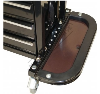
Magnetic Base Parts Tray