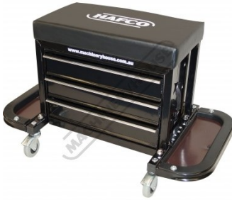
Side Trays Shown Down