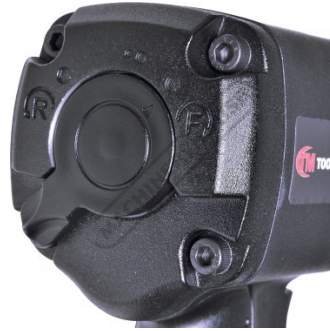
3 Forward and 1 Reverse Speed Selector