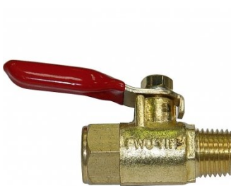
F930 Air Fittings