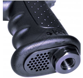
Handle Exhaust with Muffler