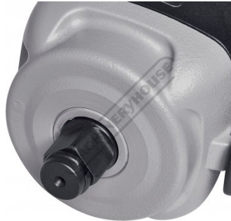
Half Inch Square Drive