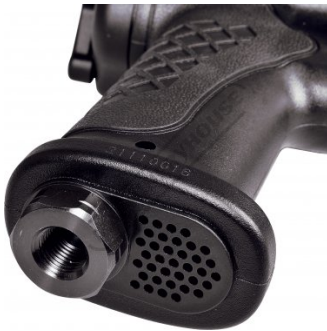
Handle Exhaust with Muffler