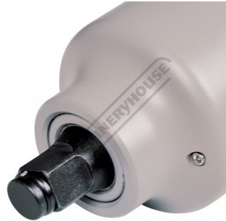
Half Inch Square Drive