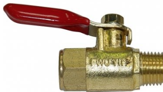
F930 Air Fittings