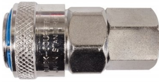
F945 High-Flow One Touch System Air Fittings