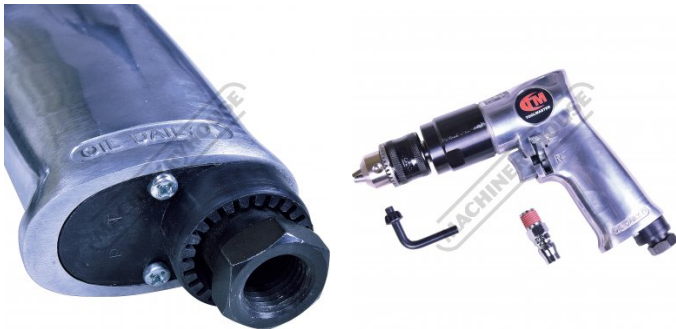
Quiet Handle Exhaust