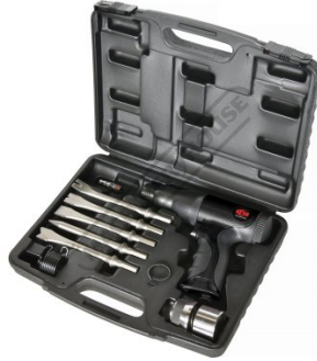
Full Kit In Case