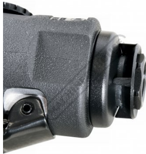
Rear Exhaust With Built In Silencer