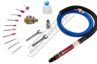
Twist Throttle Variable Speed Control Kit