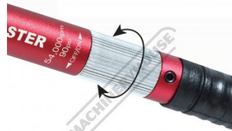
Twist throttle VARIABLE SPEED CONTROL