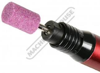
3mm Collet Head