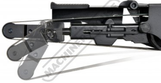
Bendable arm to 55 degrees