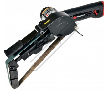
Swivel Belt Arm