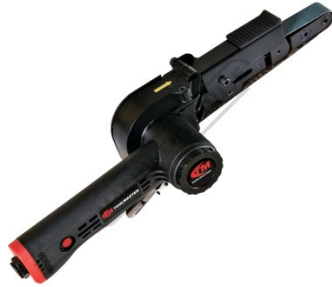
20 x 520mm belt size