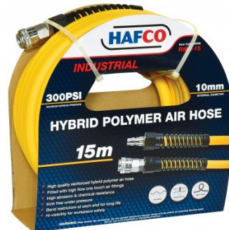
H008 Industrial Polymer Air Hose