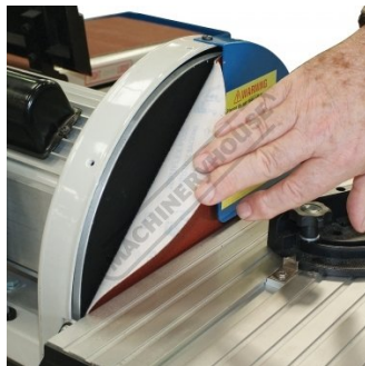
Shown Mounted to a Disc Sander with a Velcro Abrasive Disc Attached