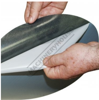
Self Adhesive Backing