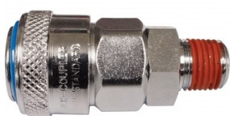
F941 High-Flow One Touch System Air Fittings