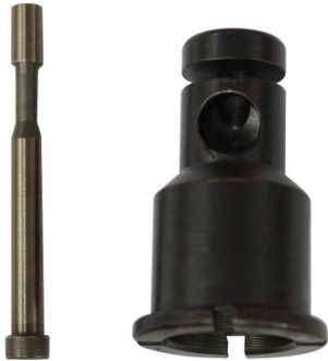
A082A Air Nibbler Cutter Set