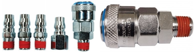
F941 High-Flow One Touch System Air Fittings