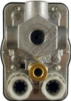
Bottom Of Pressure Switch