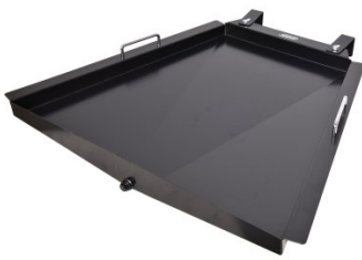
A338 Engine Stand Drip Tray