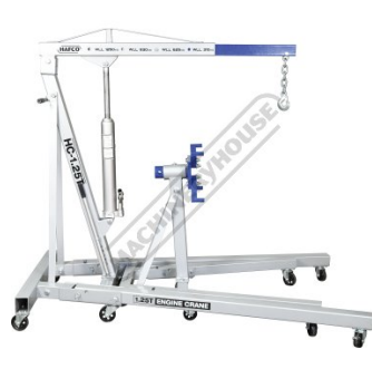
Easy Engine Removal with Optional Engine Crane