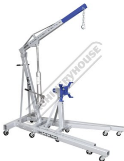
Easy Engine Slots in Perfectly with Optional Engine Crane