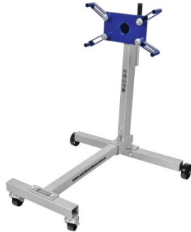
A3425 Engine Tilter - Heavy Duty