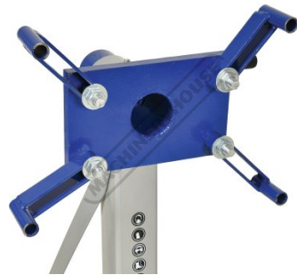
Four Adjustable Mounting Arms