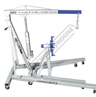
Easy Engine Removal with Optional Engine Crane Top View