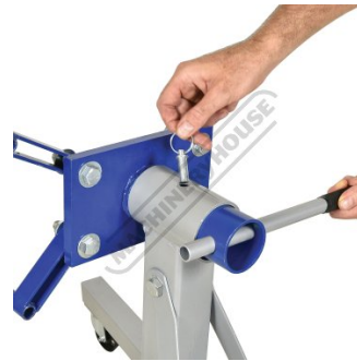
Quick Release-Index Pin for Rotation