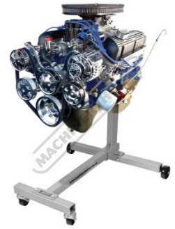
Engine Mounted To Stand