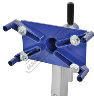
Adjustable Head Arms