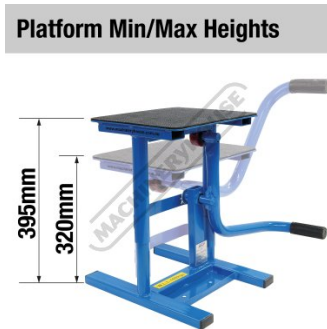
Platform Min Max Heights 320-395mm