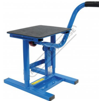
Fully Down Front View