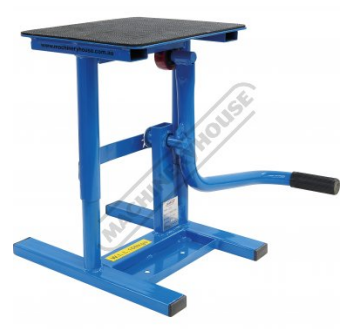
Fully Up Front View