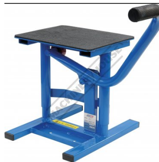
Down Position Rear View