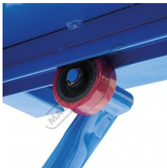
Roller Lift Guide