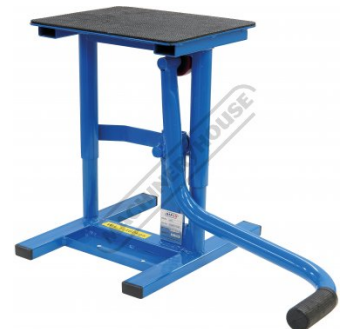
Up Position Rear View