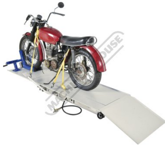
Shown with Optional Motorbike and Straps Rear View