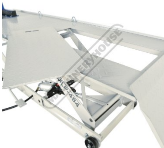
Removable Rear Plate for Maintenance