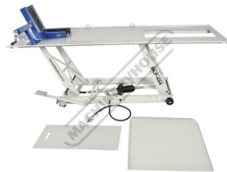
Shown with Mounting Plates Off