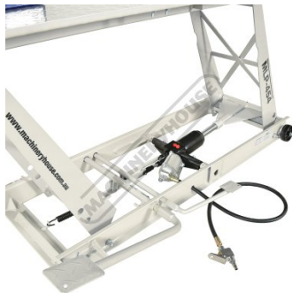
Pneumatic Hydraulic Cylinder