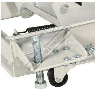
Front Swivel Wheels and Adjustable Stops