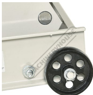
Rear Caster Wheels