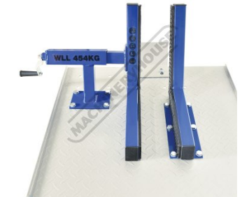
Front Wheel Clamp Adjustment