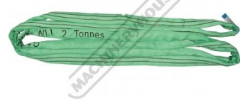
H312 Round Sling