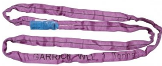
H305 Round Sling