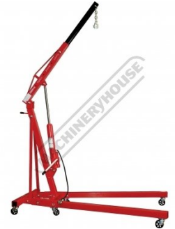
Shown Fully Up and Extended