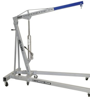
A350 Hydraulic Engine Crane