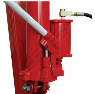
Single Action Pump With Release Valve