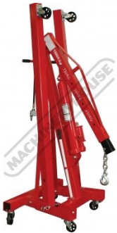
Shown Folded Up