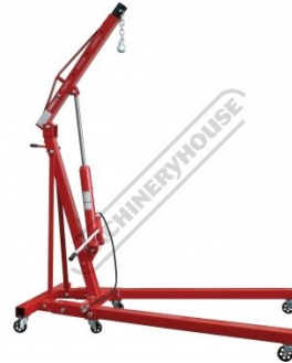
Shown Fully Up