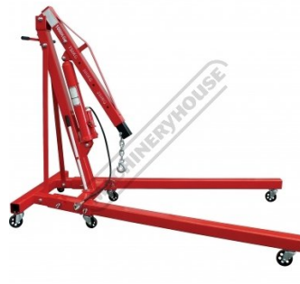
Shown With Ram Fully Down