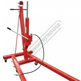
Pneumatic Hydraulic Single Action Ram