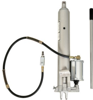
J033 Pneumatic / Hydraulic Ram - Long Stroke with Yoke