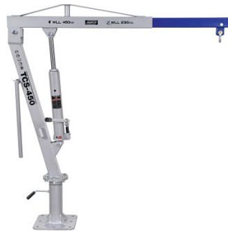
A353 Swivel Crane - Truck or Ute