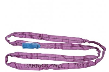
H305 Round Sling