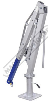
Rear View Fully Down