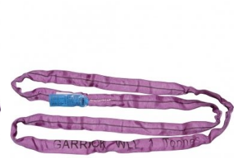
H305 Round Sling