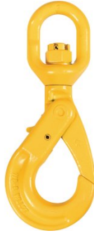
H331 Self Locking Swivel Hook