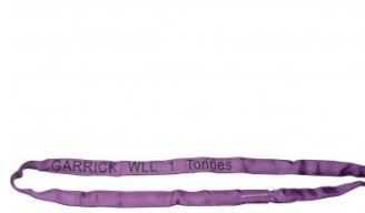
H300 Round Sling