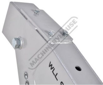
Mounting Base Plate