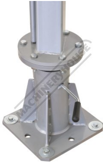
Locking Handle For Swivel Crane