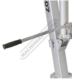
Single Action Pump With Release Valve