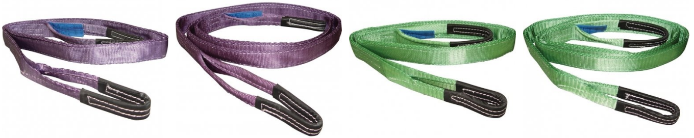
H324 Flat Sling