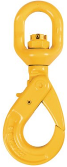
H330 Self Locking Swivel Hook