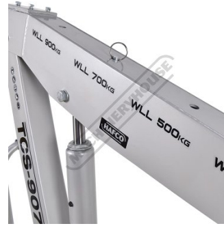
Jib Position Locking Pin