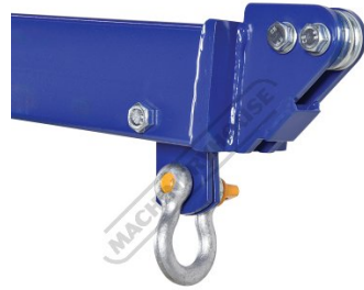
2 Ton D Shackle & Pully