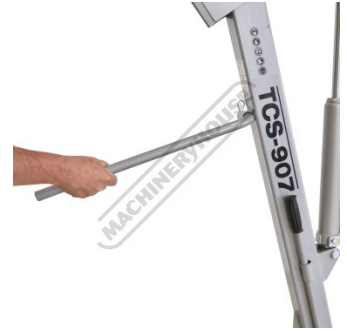
Handle For Swiveling Crane