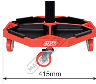
415mm Wide Base