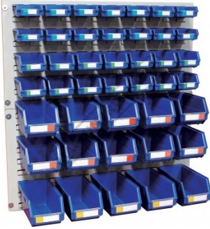
Shown with Optional Buckets on Panels