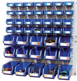
Shown with Optional Buckets and Tools