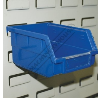
Shown with Optional Buckets