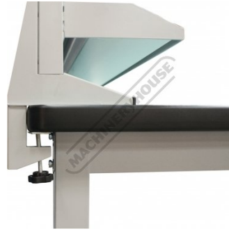
Shown Clamped to Optioanl Table