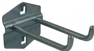
A442 Hook - Double Prong