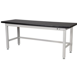
A421 Industrial Work Bench