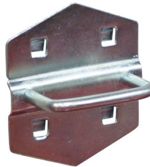
A4492 Hook - U Shape Holder