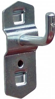
A439 Hook - Single Prong