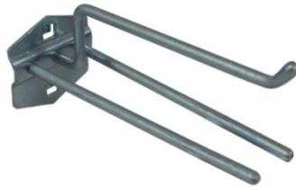
A444 Plier Holder - Triple Prong