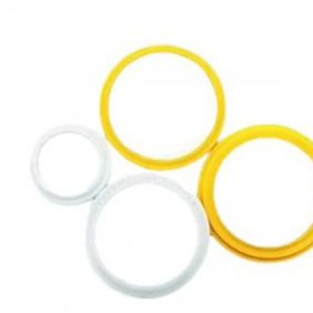
AL3009 Bottom Protective Lens Seal