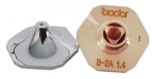
AL3018 1.4 Nozzle Double Layer