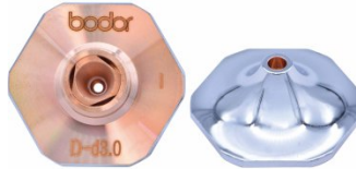
AL3021 3.0 Nozzle Double Layer