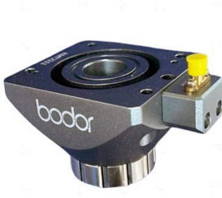
AL3002 Bottom Block