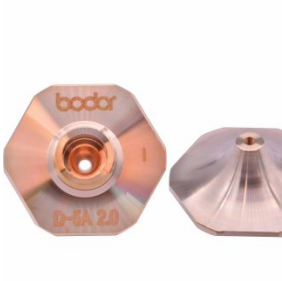
AL3013 2.0 Nozzle Single Layer