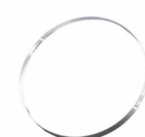
AL3008 Bottom Focus Protective Lens