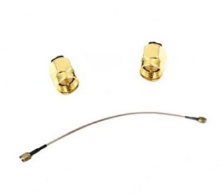
AL3011 Radio Frequency Cable