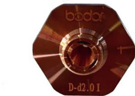
AL3020 2.0 Nozzle Double Layer