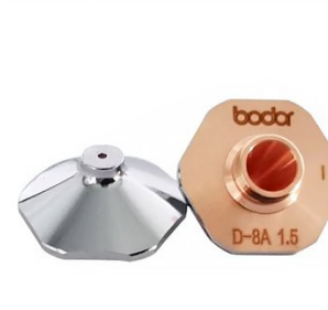
AL3012 1.5 Nozzle Single Layer