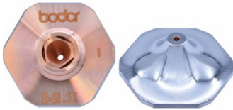
AL3019 1.5 Nozzle Double Layer