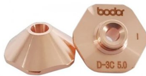
AL3016 5.0 Nozzle Single Layer