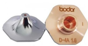
AL3054 1.6 Nozzle Single Layer