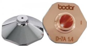
AL3053 1.4 Nozzle Single Layer