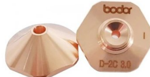
AL3014 3.0 Nozzle Single Layer