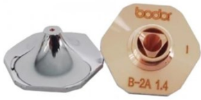
AL3018 1.4 Nozzle Double Layer