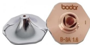
AL3055 1.6 Nozzle Double Layer