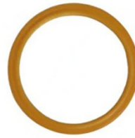
AL3052 Bottom Protective Lens Seal