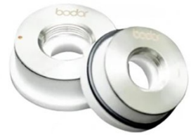
AL3010 Ceramic Ring