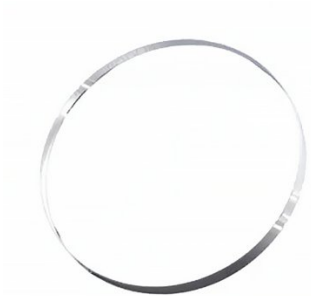
AL3051 Bottom Focus Protective Lens