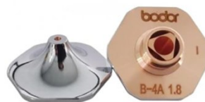
AL3056 1.8 Nozzle Double Layer