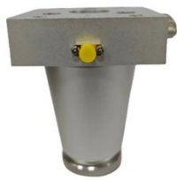
AL3044 Bottom Block