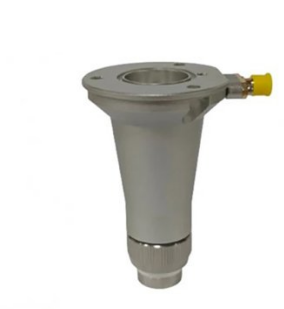
AL3059 Bottom Block