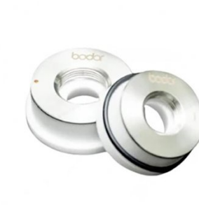
AL3010 Ceramic Ring