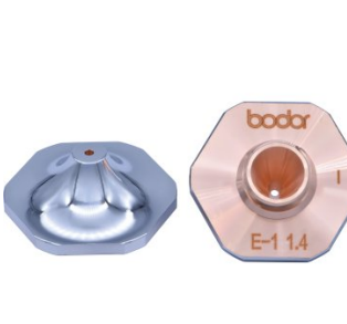
AL3065 1.4 Nozzle Single Layer