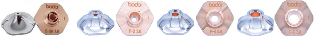
AL3072 7.0 Nozzle Double Layer