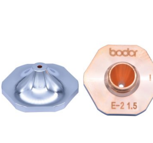
AL3066 1.5 Nozzle Single Layer