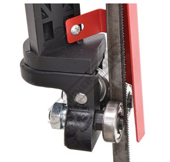
Fully Adjustable Blade Rollers