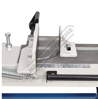
Vice at 90 Degrees