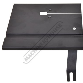
Includes Vertical Cutting Table