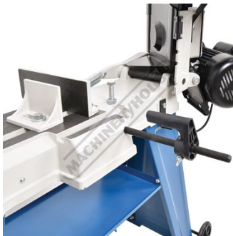
Adjustable Length Stop