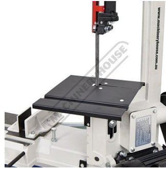
Vertical Cutting Table