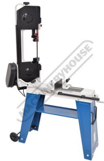
Rear View Head Up