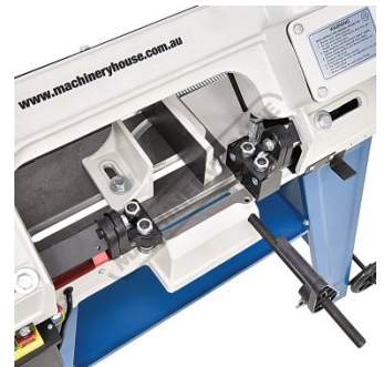
Cutting Area Top View