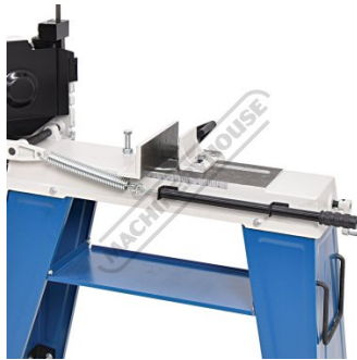
Adjustable Spring Tension to Regulate Cutting Feed Rate