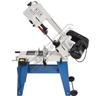
Front View 2