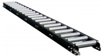
L812 Roller Conveyor