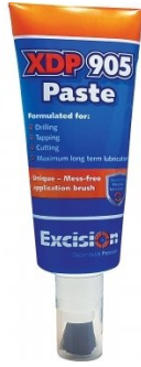
S075 Cutting Tool Lubricant Paste - 200g