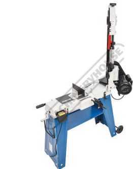
Left Top Full View