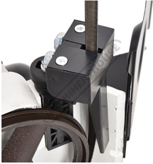
Cover Ready for Vertical Cutting Table