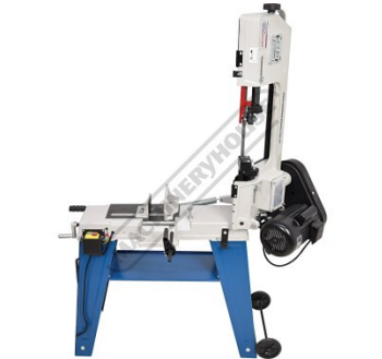
Front View 3