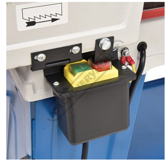
Automatic Cut Out Switch