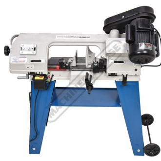
Front View 1