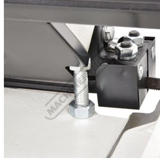
Adjustable Head Stop