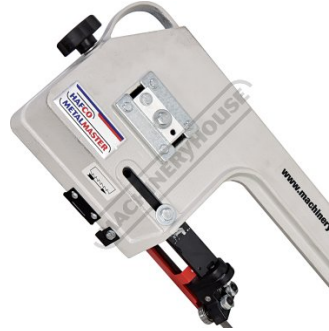
Blade Tension Handle