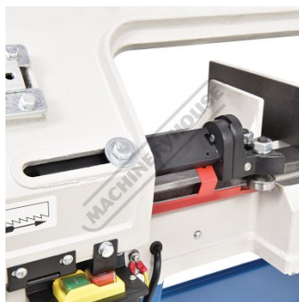
Left Adjustable Blade Guide