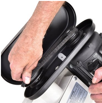
Changing Belt Pulley Speed