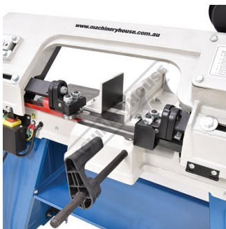
Cutting Area Close Up