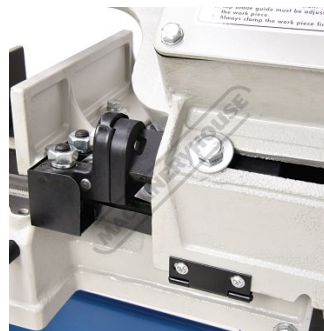
Right Adjustable Blade Guide