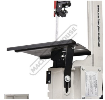
Vertical Cutting Table Attached