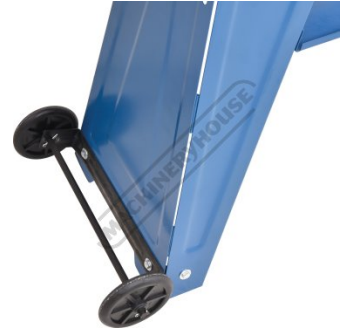
Portable for Site Work