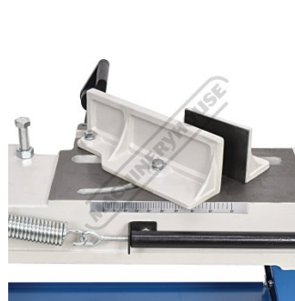
Vice at 45 Degrees