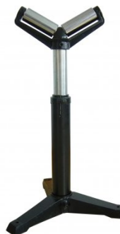
W3436 Roller Stand - V-Type