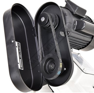
3 Speed Pulley Drive System