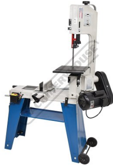
Head Fully Up with Vertical Table