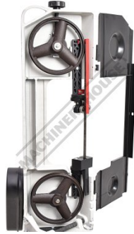
Blade Guard Open