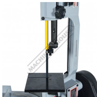
Vertical Cutting Table Close Up