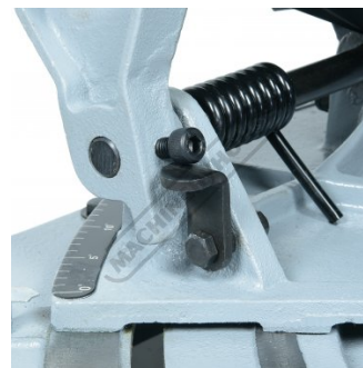
Vertical Head Position Safety Latch