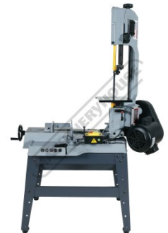
Shown with Vertical Cutting Table