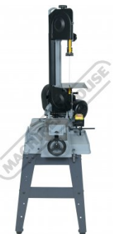
Vertical Cutting Table Front View