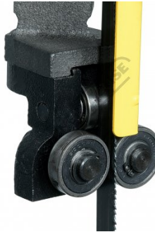
Front Ball Bearing Blade Guides