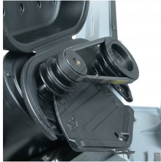
3 Speed Pulley Drive System