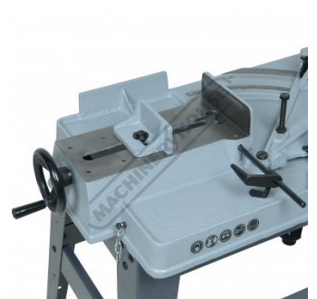
Vice Clamping Fixture