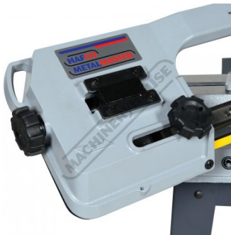
Blade Tension Dial