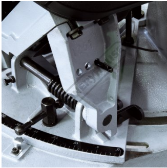
Adjustable Spring To Set Cutting Beam Force