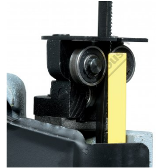
Rear Ball Bearing Blade Guides