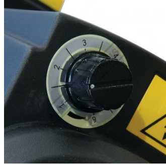
Variable Speed Dial