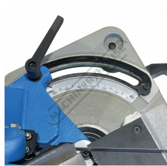
Swivel Head Angle Scale