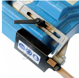
Blade Guide Adjustment