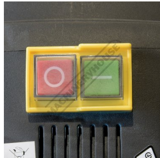
Main Power Switch