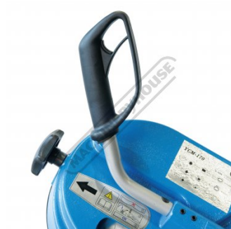
Blade Trigger on/off Switch