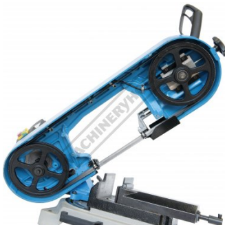
Rear View Blade Guard Off