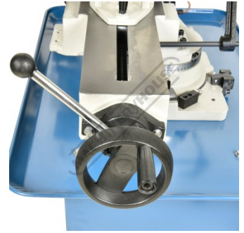
Quick Action Vice Handle Lever