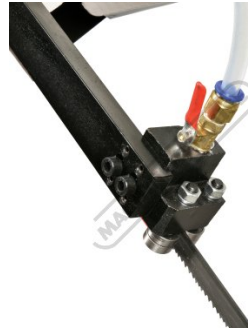
Coolant to Blade