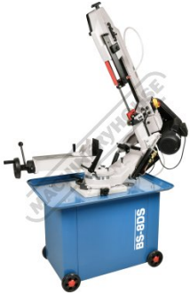
Head Fully Raised