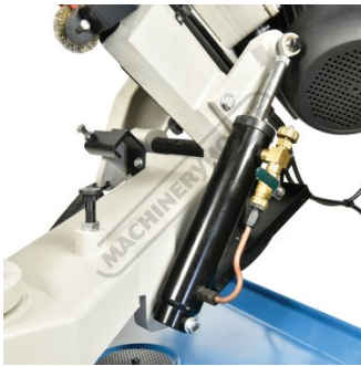
Hydraulic Ram Down Feed Control