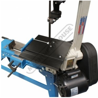
Vertical Cutting Table Position