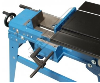
Adjustable Length Stop for Repetition Cutting