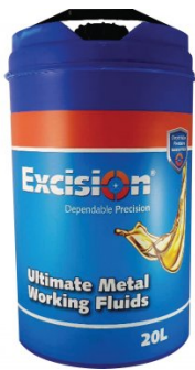
S091 Soluble Metal Cutting Fluid - 20 Litre