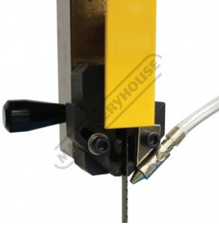
Adjustable Blade Guides and Air Pump