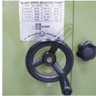
Variable Speed Handle