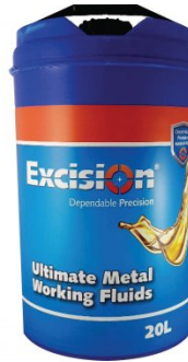
S091 Soluble Metal Cutting Fluid - 20 Litre