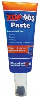
S075 Cutting Tool Lubricant Paste - 200g