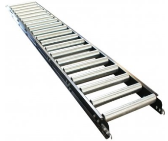
L818 Roller Conveyor