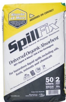
O000 SpillFix Universal Organic Absorbent