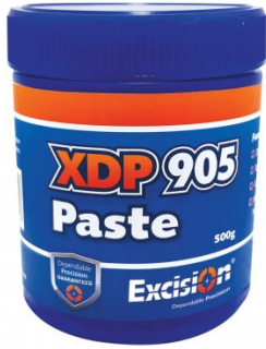
S074 Cutting Tool Lubricant Paste - 500g