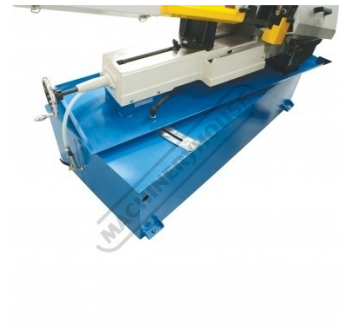
Swivel Head For Mitre Cutting