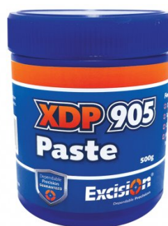
S074 Cutting Tool Lubricant Paste - 500g