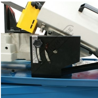
Height Adjustment for Arm Return