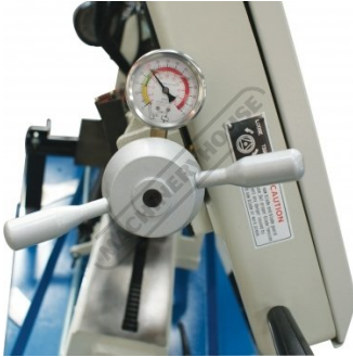
Blade Tension Levers With Gauge