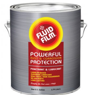
O044 Rust & Corrosion Preventive