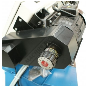
Variable blade speed