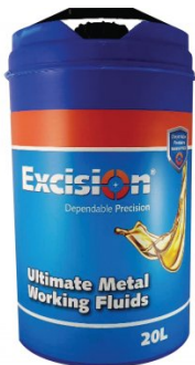
s091 Soluble Metal Cutting Fluid - 20 Litre