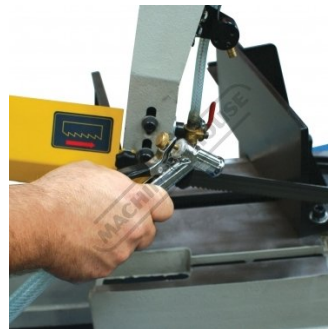
Coolant Cleaning Gun