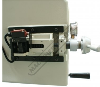
Automatic Blade Breakage Sensor