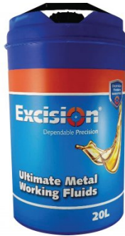
S091 Soluble Metal Cutting Fluid - 20 Litre