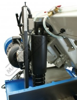
Rear Hydraulic System