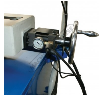
Hydraulic Vice Rear