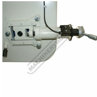
Blade Breakage Rear