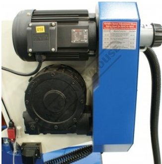
Heavy Duty Gearbox