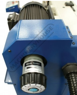
Variable Blade Speed