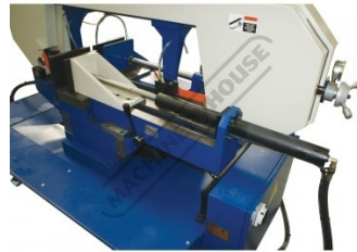
Full Stroke Hydraulic Clamping Vice