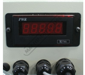
Digital Blade Speed Display