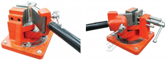
No.2 Bar Bender 102 x 7mm Capacity Rear View