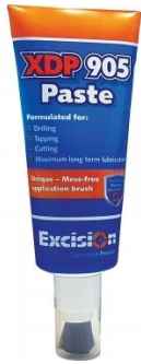
S075 Cutting Tool Lubricant Paste - 200g