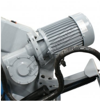
Motor and Gearbox Drive