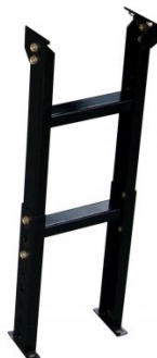
L814 Roller Conveyor Stand