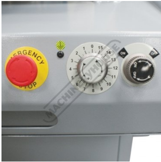
Adjustable Automatic Feed