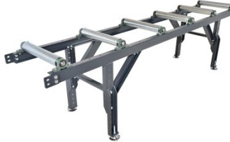
L835 Roller Conveyor with Adjustable Stands - Extra Heavy Duty