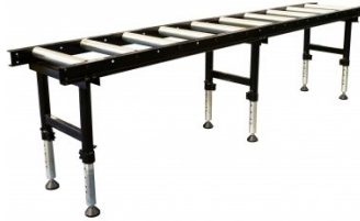
L830 Roller Conveyor with Adjustable Stands - Heavy Duty