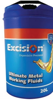
S091 Soluble Metal Cutting Fluid - 20 Litre