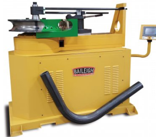
B8100 Motorised Pipe & Tube Rotary Draw Bender