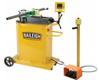
B8085 Motorised Pipe & Tube Rotary Draw Bender