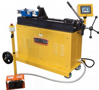
B8095 Motorised Pipe & Tube Rotary Draw Bender