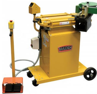
B8080 Hydraulic Pipe & Tube Rotary Draw Bender