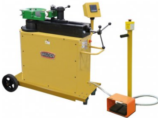
B8090 Motorised Pipe & Tube Rotary Draw Bender