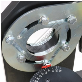
Self Centering Vice Shown Open