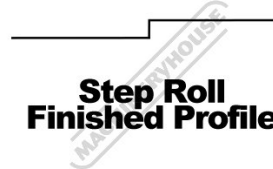
Step Roll Finished Profile