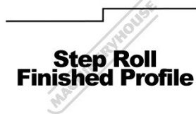
Step Roll Finished Profile