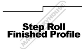
Step Roll Finished Profile